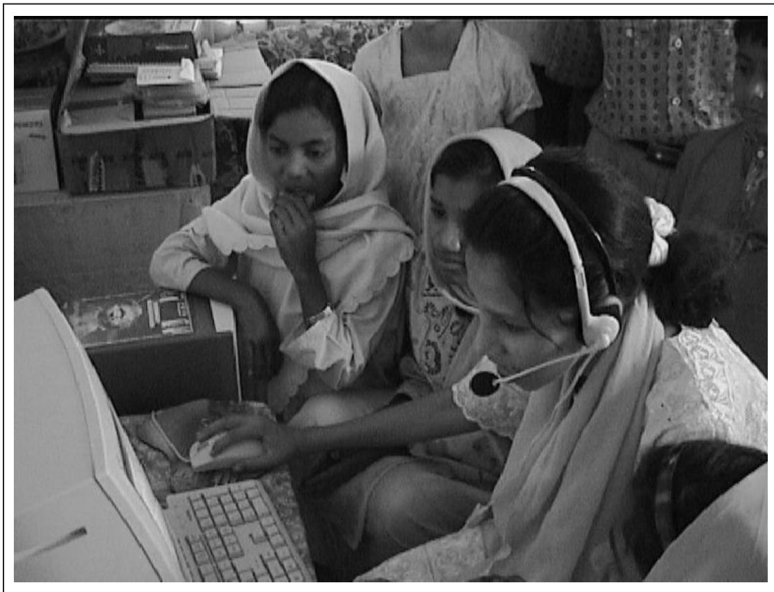
Figure 1. Children at Peace High School, Edi Bazaar, Hyderabad, India, working on their computer.

should try to improve their English pronunciation by reading passages from their school English textbooks into Dragon and to try to make Dragon recognize as much of their readings as possible. They were told to use Ellis if they wished, or to watch any film of their choice on the computer, if bored. It was suggested to each group that they should help each other and collectively organize what they would do with the computer when it was their turn to use it. There was to be no organized adult intervention after this point, except in case of any equipment failure and related maintenance activity. We relied on the earlier results (Mitra 1988, 2003; Mitra and Rana 2001) that groups of children can instruct themselves without teachers if given adequate computing resources. In effect, the children were left with a clear objective (to alter their speech until understood by the Dragon STT program) and a demonstration of the resources available (i.e., computer, Dragon, Ellis, and movies). They were asked to organize themselves to meet this objective and they