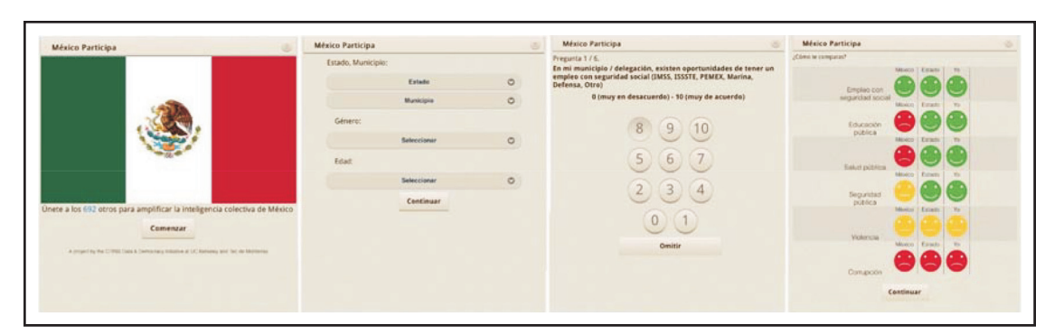
Figure 1. User interface of México Participa: Quantitative evaluation phase.

in two stages: first, with an internal team to review phrasing and the order of the questions and, second, in external control groups. Both tests ensured that the team could resolve any irregular behavior immediately.