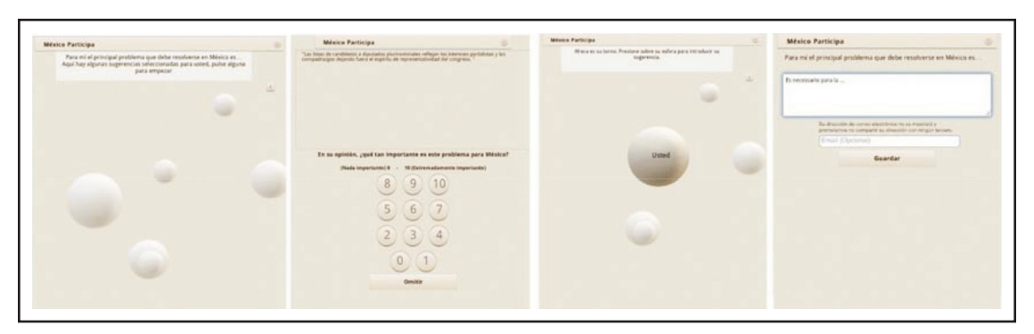
Figure 2. User interface of México Participa: Qualitative evaluation phase.

quantitative questions. This mechanism allows participants to immediately discern other participants with similar opinions.