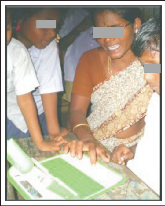
Figure 3. Teacher Dominating the Use of the Laptop.

A more pressing issue might be teachers’ core attitudes toward the adoption of ICT for pedagogical purposes. Teachers unanimously maintained that primary-level children would not benefit from technologies, stating, “What are children going to do by learning how to use computers? They are only in the primary level. It is us teachers who need to learn, not them.”