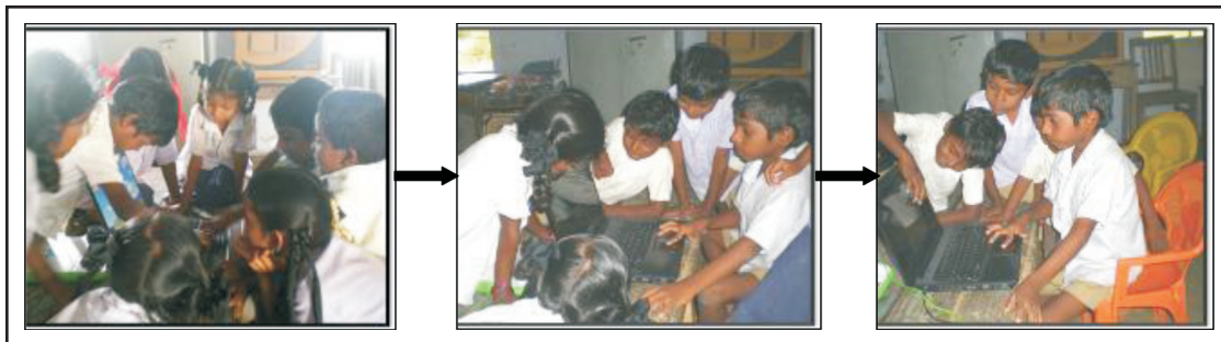
Figure 2. Boys dominating computer use over time, from all children gathering around the PC to fewer girls managing to stay, until only the boys remained.

learn how to use the computer. [Boys] are the ones who will be furthering their studies . . . computers will be useful to them.”